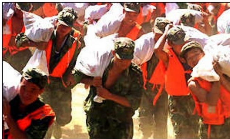
Soldiers and sandbags battle against nature

The authorities in China have admitted for the first time that excessive exploitation of natural resources could be behind this year's devastating floods.