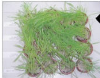
Highly eco-toxicity sensitive Summer Barley Bottom Row: Summer Barley in dirt. Top Row: Wheatware™ Compost.