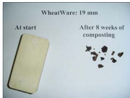
Within 8 weeks, test blocks reduced to small granules , then further degrade in compost.